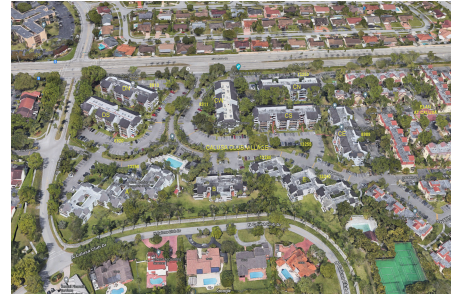
Built in 1983/1986 - 276 units - 4 floors

Number of units: 276 Number of active listings for rent: 9 Number of active listings for sale: 4 Building inventory for sale: 1% Number of sales over the last 12 months: 6 Number of sales over the last 6 months: 3 Number of sales over the last 3 months: 1 Calusa Club Village Property Owners 14275 SW 142nd Ave Miami, FL 33186 (305) 253-7977 https://