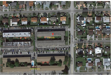
Built in 1969 - 46 units - 2 floors