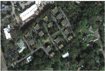
Built in 1991 - 60 units - 3 floors