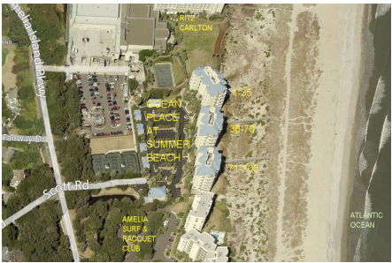
Built in 1997 - 105 units - 7 floors