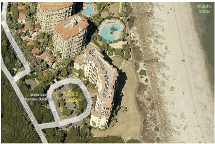
Built in 1985 - 58 units - 6 floors

Number of units: 58 Number of active listings for rent: 0 Number of active listings for sale: 1 Building inventory for sale: 1% Number of sales over the last 12 months: 1 Number of sales over the last 6 months: 1 Number of sales over the last 3 months: 0 Piper Dunes Association Address: 1530 Beach Walker Rd, Fernandina Beach, FL 32034, Phone:+1 904-277-8628 https://