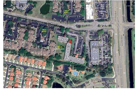
Built in 1983 - 68 units - 4 floors

Boca Entrada 10235 Boca Entrada Blvd Boca Raton, FL 33428 (561) 488-4983 https://