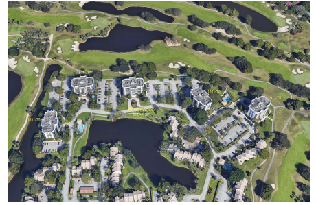
Built in 1974 - 190 units - 7 floors