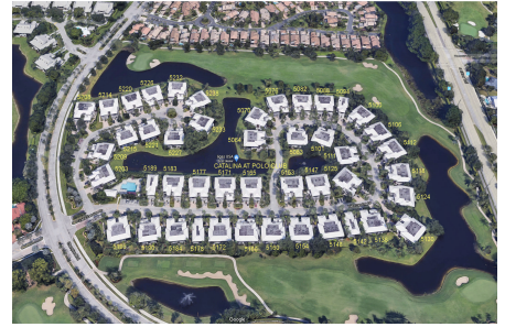
Built in 1989 - 176 units - 2 floors

Number of units: 176 Number of active listings for rent: 0 Number of active listings for sale: 3 Building inventory for sale: 1% Number of sales over the last 12 months: 11 Number of sales over the last 6 months: 5 Number of sales over the last 3 months: 3 Catalina at the Polo Club Condominium Association Inc 951 Broken Sound Parkway 250 Boca Raton, FL 33487 (561) 994-1788 https://