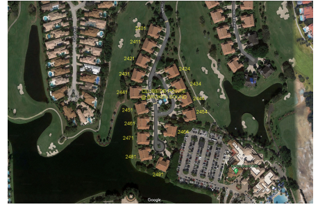
Built in 1987/1991 - 60 units - 2 floors

Broken Sound Master Association Address: 2701 NW 64th Blvd, Boca Raton, FL 33496 Phone: +1 561-998-5813