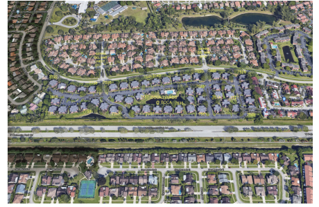
Built in 1984/1987 - 200 units - 2 floors