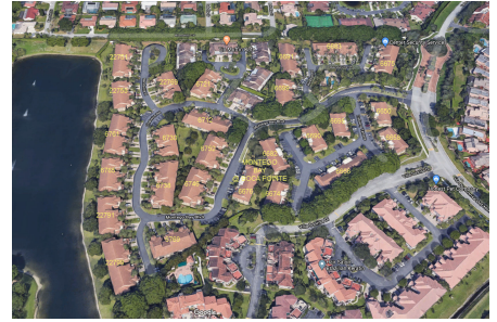
Built in 1988/1994 - 188 units - 2 floors

Number of units: 182 Number of active listings for rent: 1 Number of active listings for sale: 4 Building inventory for sale: 2% Number of sales over the last 12 months: 3 Number of sales over the last 6 months: 3 Number of sales over the last 3 months: 1 Boca Pointe Community Association Address: 6909 SW 18th St A120, Boca Raton, FL 33433 Phone: +1 561-395-7551 https://www.bocapointe.com/index_normal.html