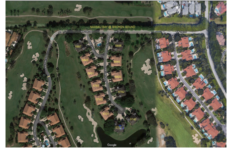
Built in 1989 - 48 units - 2 floors

https://www.dnb.com/business-directory/company-profiles.community_maintenance_as