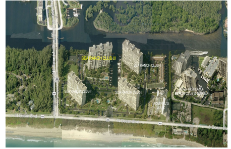
Built in 1990 - 142 units - 18 floors

Number of units: 142 Number of active listings for rent: 4 Number of active listings for sale: 4 Building inventory for sale: 2% Number of sales over the last 12 months: 3 Number of sales over the last 6 months: 1 Number of sales over the last 3 months: 1 Sea Ranch Club of Boca Condominium Association Inc 4301 N Ocean Blvd Ofc, Boca Raton, FL 33431 (561) 395-4723 (561) 395-0447 https://