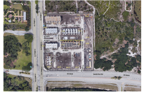
Built in 2017 - 75 units - 3 floors