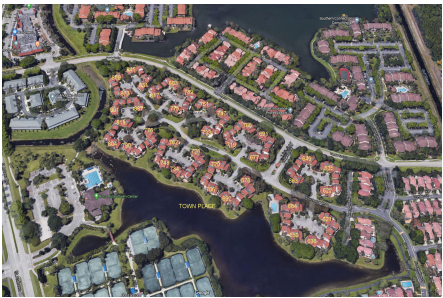
Built in 1981/1985 - 145 units - 2 floors