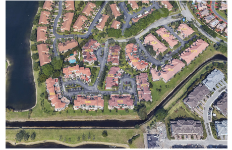
Built in 1985/1997 - 134 units - 2 floors