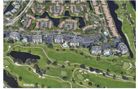
Built in 1980 - 276 units - 8 floors

Number of units: 276 Number of active listings for rent: 2 Number of active listings for sale: 3 Building inventory for sale: 1% Number of sales over the last 12 months: 24 Number of sales over the last 6 months: 15 Number of sales over the last 3 months: 7 Willow Wood Mid Rise Condo II Address: 6801 Willow Wood Dr, Boca Raton, FL 33434 Phone: +1 561-483-7356 https://