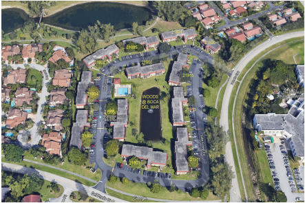
Built in 1982 - 138 units - 2 floors

Number of units: 138 Number of active listings for rent: 4 Number of active listings for sale: 0 Building inventory for sale: Number of sales over the last 12 months: 0% Number of sales over the last 6 months: 4 Number of sales over the last 3 months: 1 The Woods of Boca Del Mar Condominium Association Inc. 1000 Holland Drive Suite 2 Boca Raton, FL 33487 (561) 994-5850 https://