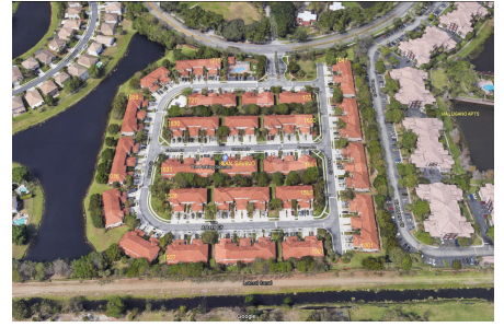
Built in 2001 - 128 units - 2 floors