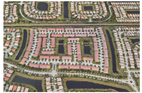
Built in 2001 - 276 units - 2 floors

http://www.myvenetianisles.com/outside_home.asp