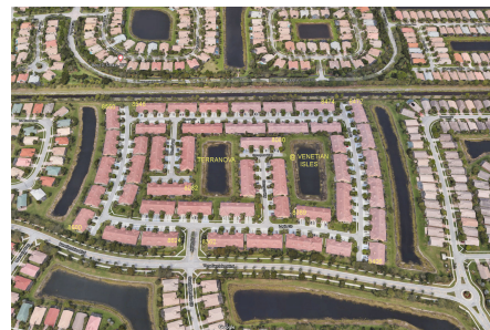
Built in 2001 - 276 units - 2 floors

https://www.myvenetianisles.com/outside_home.asp