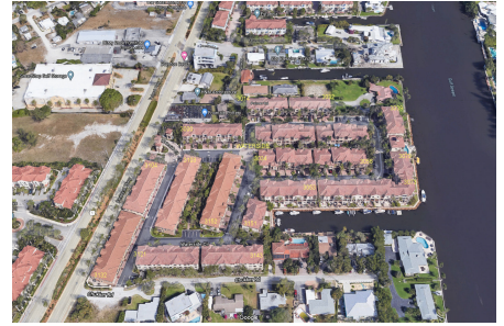
Built in 2008 - 113 units - 3 floors

Number of units: 113 Number of active listings for rent: 0 Number of active listings for sale: 0 Building inventory for sale: Number of sales over the last 12 months: 0% Number of sales over the last 6 months: 0 Number of sales over the last 3 months: 0 Waterside Boynton Beach HOA 3102 South Federal Highway Boynton Beach, FL 33435 (561) 733-6269 https://