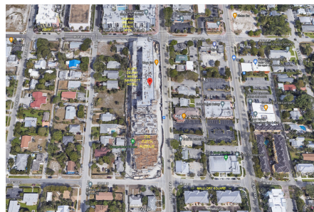
Built in 2019 - 32 units - 4 floors

Number of units: 32 Number of active listings for rent: 1 Number of active listings for sale: 2 Building inventory for sale: 6% Number of sales over the last 12 months: 1 Number of sales over the last 6 months: 0 Number of sales over the last 3 months: 0 236 Fifth Avenue Delray Beach Address: 236 SE 5th Ave, Delray Beach, FL 33484 Phone: +1 561-704-5559 https://