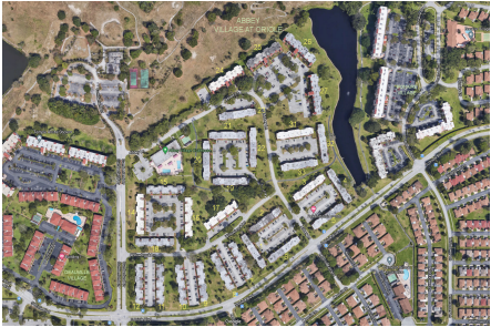
Built in 1978 - 528 units - 2 floors

Abbey Village Condominium Association, Inc Address: 6294 Abbey Ln, Delray Beach, FL 33446 Phone: +1 561-499-1438 https://www.akamfl.com/abbeyvillage/home.asp