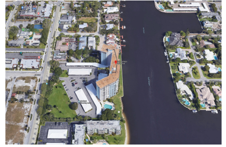
Built in 1972 - 103 units - 13 floors