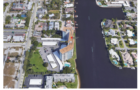
Built in 1972 - 103 units - 13 floors