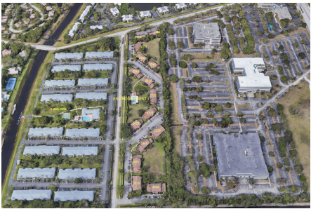
Built in 1984/1987 - 92 units - 2 floors