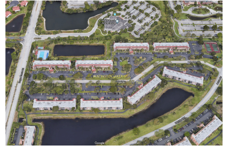
Built in 1987 - 320 units - 4 floors

Huntington Lakes Inc Address: 7355 Huntington Ln, Delray Beach, FL 33446 Phone: +1 561-498-0228 https://hlidelray.com/