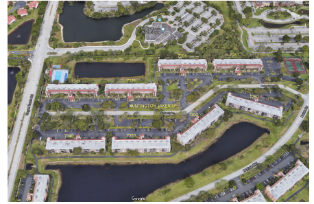
Built in 1987 - 320 units - 4 floors

Number of units: 320 Number of active listings for rent: 3 Number of active listings for sale: 5 Building inventory for sale: 1% Number of sales over the last 12 months: 13 Number of sales over the last 6 months: 8 Number of sales over the last 3 months: 3 Huntington Lakes Inc Address: 7355 Huntington Ln, Delray Beach, FL 33446 Phone: +1 561-498-0228 https://hldelray.com/