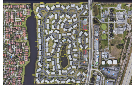
Built in 1980 - 700 units - 2 floors

Number of units: 700 Number of active listings for rent: 7 Number of active listings for sale: 20 Building inventory for sale: 2% Number of sales over the last 12 months: 22 Number of sales over the last 6 months: 10 Number of sales over the last 3 months: 4 Pines of Delray North Association Inc Address: 1431 NW 18th Ave, Delray Beach, FL 33445 Phone: +1 561-278-1212 https://www.pinesnorthofdelray.com/Page/23