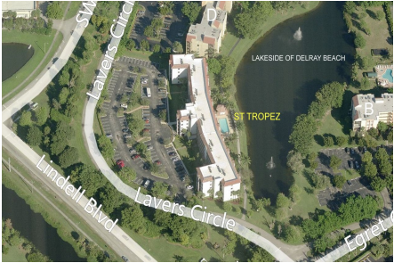
Built in 2000 - 64 units - 5 floors