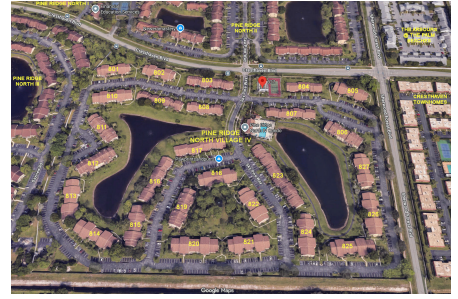
Built in 1986 - 400 units - 3 floors

Pine Ridge IV Condominium Association, Inc. 3591 Pine Needle Dr Greenacres, FL 33463+1 561-967-7727 https://pineridgenorth4.org/