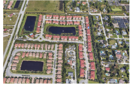
Built in 2008 - 134 units - 2 floors

Verona Palms Homeowners' Association, Inc 6620 Lake Worth Road # F Lake Worth, FL 33467 (954) 792-6000 Verona Palms H O A 6410 Macarthur Palm Trl, Greenacres, FL 33463 (561) 766-1527 https://