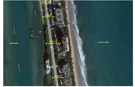
Built in 1998 - 24 units - 13 floors

Carlyle Jupiter Island Condo 19700 Beach Road Jupiter, FL 33469 (561) 748-4840