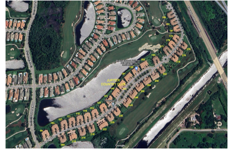
Built in 2008/2019 - 149 units - 1 floor

Number of units: 149 Number of active listings for rent: 0 Number of active listings for sale: 6 Building inventory for sale: 4% Number of sales over the last 12 months: 12 Number of sales over the last 6 months: 6 Number of sales over the last 3 months: 2 Jupiter Country Club HOA 280 Cortona Blvd Jupiter, FL 33478 Phone: 561-529-3436 https://