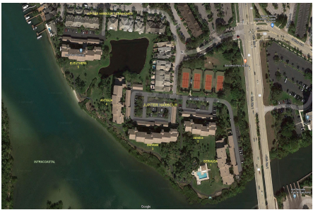
Built in 1981 - 97 units - 5 floors