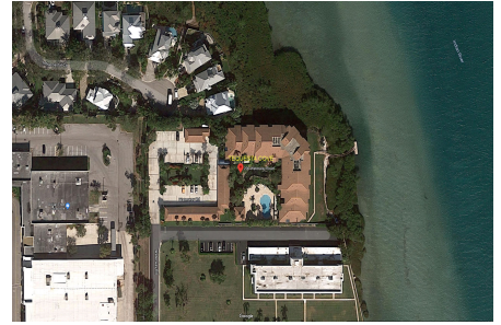
Built in 1985 - 24 units - 3 floors

Number of units: 24 Number of active listings for rent: 2 Number of active listings for sale: 6 Building inventory for sale: 25% Number of sales over the last 12 months: 2 Number of sales over the last 6 months: 1 Number of sales over the last 3 months: 0 Tequesta Cove Condominium Association, Inc 200 Waterway Road Jupiter, FL 33469 (561) 744-1493 https://