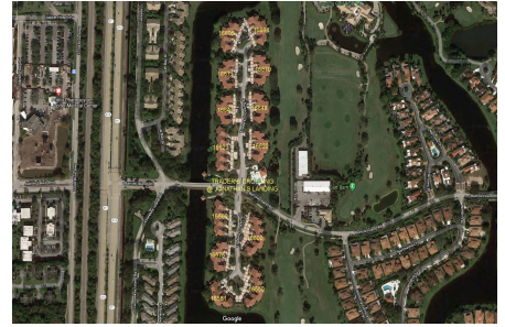
Built in 1988 - 110 units - 2 floors

https://jonathanslandingpoa.com/the-villages/traders-crossing