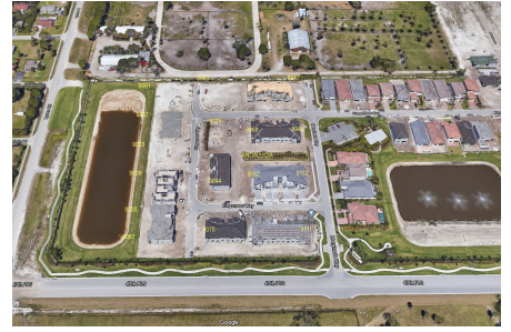
Built in 2018 - 60 units - 2 floors