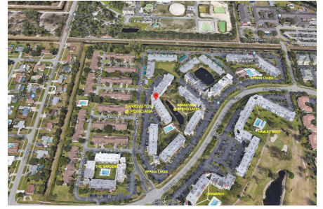
Built in 1986 - 64 units - 4 floors

Poinciana Place Condominium Assn, Inc. CMC Management (561) 967-7420 (561) 641-1016 https://www.poinciana1and2.com/