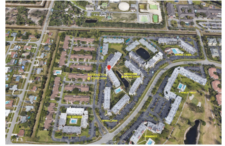
Built in 1986 - 64 units - 4 floors

Number of units: 64 Number of active listings for rent: 0 Number of active listings for sale: 3 Building inventory for sale: 4% Number of sales over the last 12 months: 2 Number of sales over the last 6 months: 2 Number of sales over the last 3 months: 2 Poinciana Place Condominium Assn, Inc. CMC Management (561) 967-7420 (561) 641-1016 https://www.poinciana1and2.com/