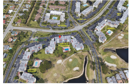
Built in 1981 - 64 units - 4 floors