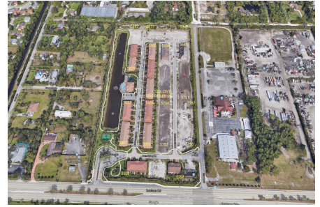
Built in 2017 - 180 units - 2 floors

Number of units: 180 Number of active listings for rent: 1 Number of active listings for sale: 8 Building inventory for sale: 4% Number of sales over the last 12 months: 9 Number of sales over the last 6 months: 8 Number of sales over the last 3 months: 2 The Colony Reserve @ Lake Worth Homeowners Association Inc 5299 Lantana Road Lake Worth, FL 33463 (561) 641-8877 (561) 249-2941 https://