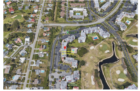
Built in 1981 - 64 units 4 floors

DORCHESTER AT POINCIANA CONDOMINIUM ASSOCIATION, INC. Location -3286 ARCARA WAY, LAKE WORTH, FL Phone - 561-641-1016 https://www.cmcmanagement.biz/dorchester.html