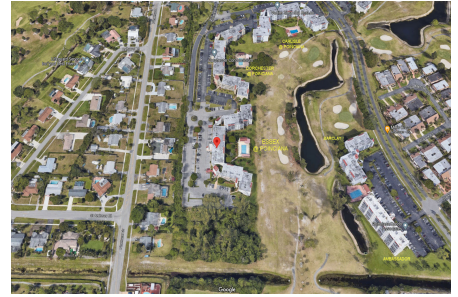
Built in 1982 - 64 units - 4 floors

Number of units: 64 Number of active listings for rent: 1 Number of active listings for sale: 0 Building inventory for sale: Number of sales over the last 12 months: 0% Number of sales over the last 6 months: 3 Number of sales over the last 3 months: 0 ESSEX AT POINCIANA CONDOMINIUM ASSOCIATION, INC. 3326 Arcara Way, Lake Worth, FL 33467 Phone - 561 - 641 - 1016 Fax - 561 - 641 - 9118 https://www.cmcmanagement.biz/essex.html