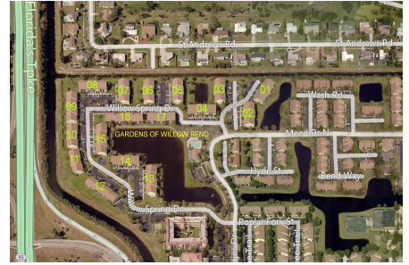
Built in 1984 - 224 units - 2 floors

Willow Bend Assn Office 3825 Meed Dr S, Lake Worth, FL 33467 (561) 964-4240