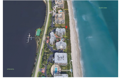
Built in 1984 - 44 units - 6 floors