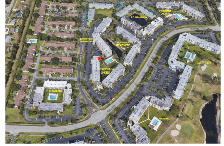
Built in 1984 - 64 units - 4 floors