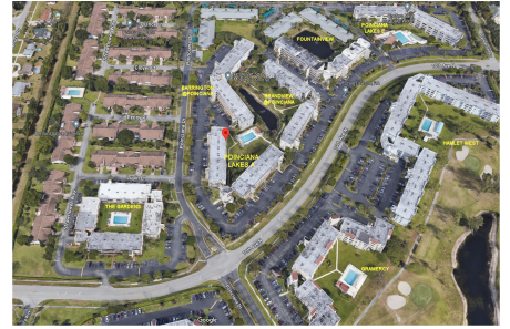
Built in 1984 - 64 units - 4 floors