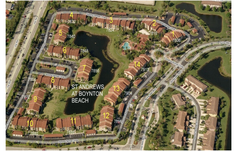
Built in 1999 - 264 units - 3 floors

St Andrews 7800 Sonoma Springs Cir, Lake Worth, FL 33463 (561) 968-3143