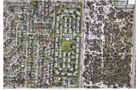
Built in 1974 - 148 units - 1 floor

Number of units: 148 Number of active listings for rent: 1 Number of active listings for sale: 1 Building inventory for sale: 0% Number of sales over the last 12 months: 5 Number of sales over the last 6 months: 1 Number of sales over the last 3 months: 1 Pointe Overlook Condo Association Inc 7275 East Oakridge Circle Lantana, FL 33462 (561) 586-0477 https://