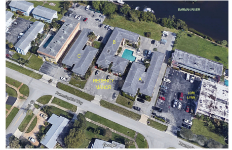
Built in 1979 - 30 units - 2 floors