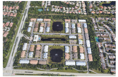
Built in 2014 - 192 units - 2 floors