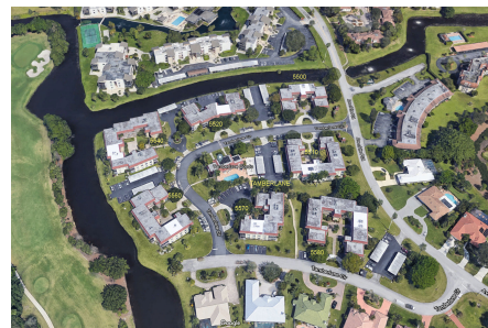
Built in 1967 - 136 units - 3 floors

Tamberlane Condominium Association Complete Property Management 3307 Northlake Blvd Suite 107 Palm Beach Gardens, FL33403 561-626-2778 Office and Contact Info 561-622-1766 561-622-1801 FAX https://www.tamberlanecondospbg.com/