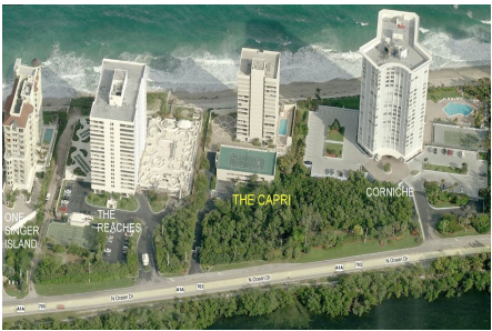
Built in 1985 - 28 units - 14 floors

Number of units: 28 Number of active listings for rent: 0 Number of active listings for sale: 0 Building inventory for sale: Number of sales over the last 12 months: 0% Number of sales over the last 6 months: 1 Number of sales over the last 3 months: 1 Capri Of Singer Island Condominium Association Inc 5250 N Ocean Drive Riviera Beach, FL33404-2657 (561) 842-0293 https://